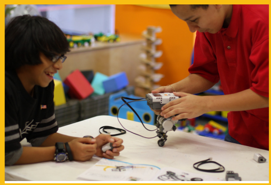
Students of the Colorbot Team have fun building a robot during Explorium Robotics Club.

Don't worry, the Explorium has not left its family friendly mission, but instead is expanding its reach through the addition of two clubs to its Clubs and Camps opportunities.