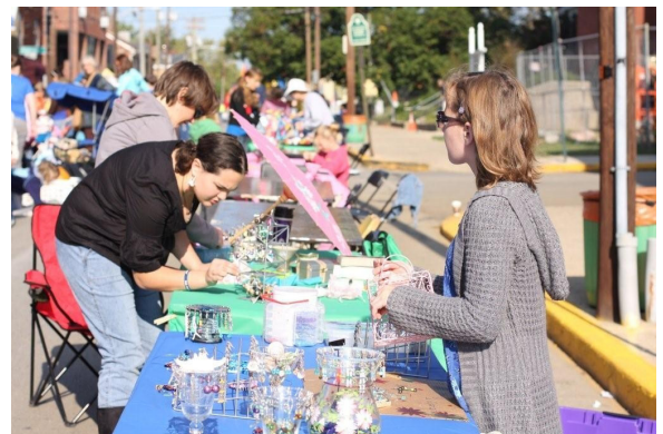
Children enjoy a day of art and entrepreneurship at last year's Musuem Go Round