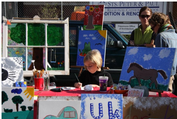
Young artist paints at her display booth at last year's Musuem Go Round